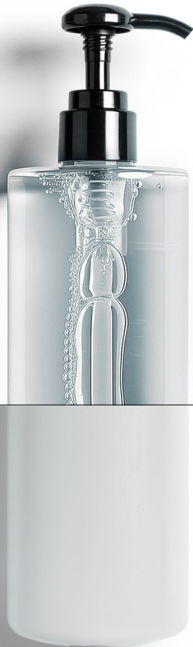
RECYCLED PLASTIC Shiny transparent