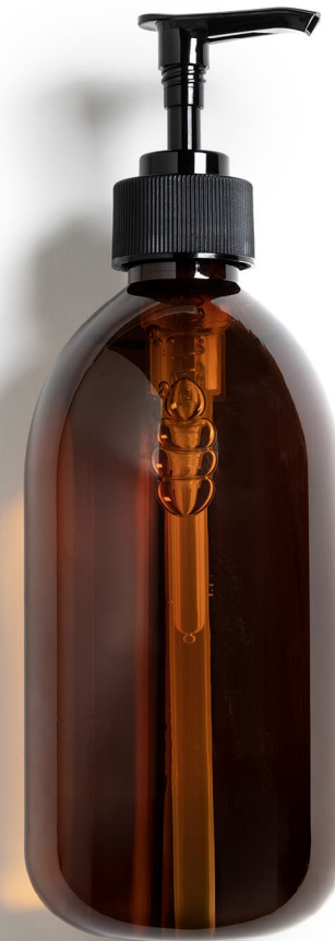
RECYCLED PLASTIC Shiny transparent