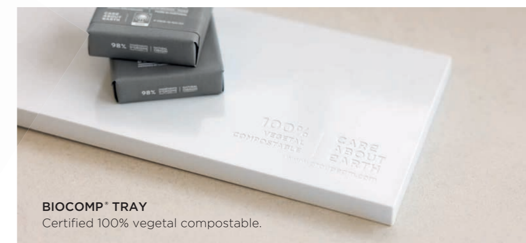
BIOCOMP® TRAY Certified 100% vegetal compostable.